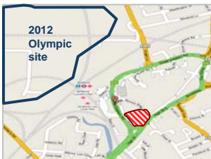
Location of Broadway Chambers, Stratford.

Broadway Chambers forms a gateway to Stratford town centre, located at the head of the High Street, close to the town's European transport hub, Westfield's 2011 'Shopping City' development and the 2012 Olympic Games Stadium. The team recognise the help and support provided by London Thames Gateway Development Corporation, the London Borough of Newham, the GLA and local stakeholders in conceiving a scheme which will make a meaningful contribution to Stratford's lasting regeneration and the Olympic legacy.