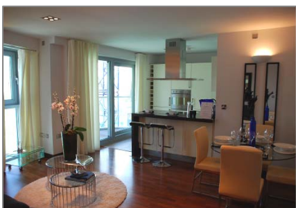
An example of one of the apartments high level of interior design

Endorsed by Wandsworth Council, the GLA and the local community, it is particularly pleasing that both the interior design and external architecture have now won international acclaim. Bridges Wharf marks over 1,300 completed residential units designed by Chantrey for Weston Homes plc.