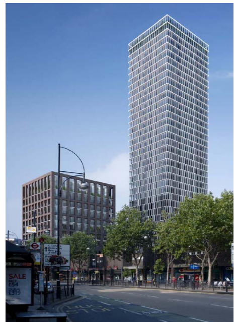
Broadway Chambers, 36 and 11 Storey residential led towers