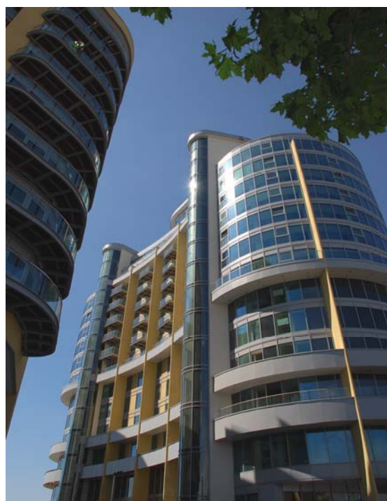
Bridges Wharf, on the south bank of the River Thames

This unrivalled collection of apartments sit within three striking glass-fronted tiered buildings. The Altura Tower also includes the Hotel Verta. The 5 star hotel is a first Von Essen 'Metropolitan Set' operation. Furnishings are in a classically 'jazz age' style, each room will have original themed artwork and the finest bespoke fittings.